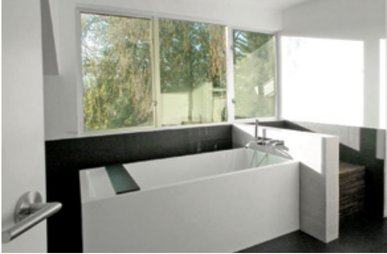
DESIGN PRINCIPAL HUI TIAN, AIA, MAIBC, LEED AP www.studio19architects.com

Clockwise from near left: A nod to Eastern living appears in the master bathroom, where a tiled foot-soaking tub is tucked behind the bathtub. In the master bedroom, a backlit drywall "headboard" adds ambience, while the radiant-heated floors are warp-resistant engineered hardwood. A frameless glass shower enclosure and recessed medicine cabinet make the guest bathroom feel more spacious. Though the guest bedroom shrunk a bit when the new basement stair was installed behind it, it now features hotel-style lightswitches on either side of the bed. A Gregg pendant in satinized glass adds a focal point—and a sense of drama—to the dining area.